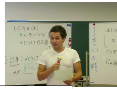
Students practicing self introductions (first week)